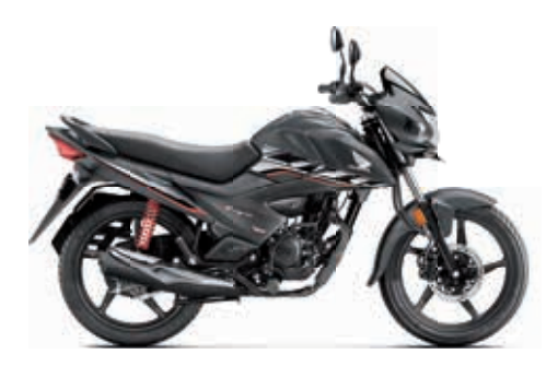
MATTE AXIS GRAY METALLIC