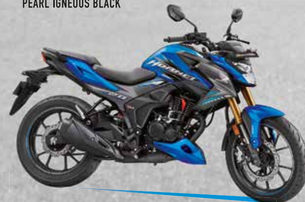
MATTE MARVEL BLUE METALLIC