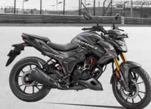
MATTE AXIS GREY METALLIC