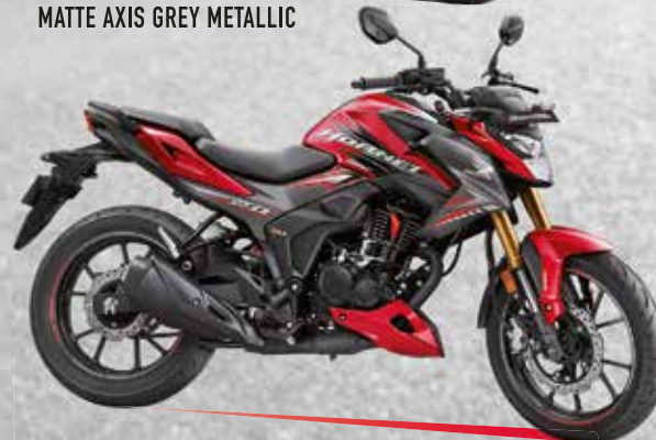
MATTE SANGRIA RED METALLIC

BOOK ONLINE NOW! www.honda2wheelersindia.com