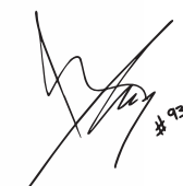
Marc Marquez MotoGP Champion