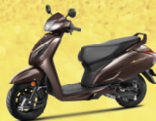
MATTE MATURE BROWN METALLIC