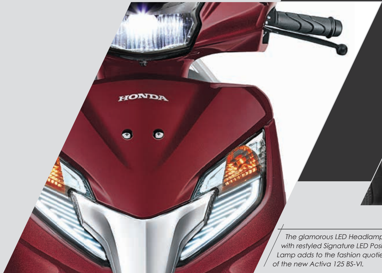
LED HEADLAMP AND SIGNATURE LED POSITION LAMP

The glamorous LED Headlamp with restyled Signature LED Position Lamp adds to the fashion quotient of the new Activa 125 BS-VI.