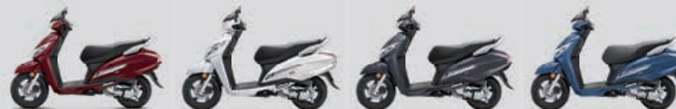
Rebel Red Metallic Pearl Precious White Heavy Grey Metallic Midnight Blue Metallic