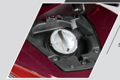
DOUBLE LID EXTERNAL FUEL FILL

One compact console ensures safety of the vehicle and convenience of opening underseat storage & external fuel lid.