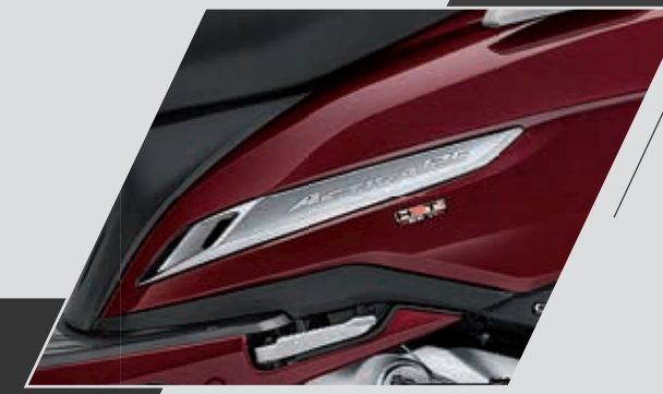
PREMIUM CHROME ON BODY

Spacious front glove box adds additional storage space.