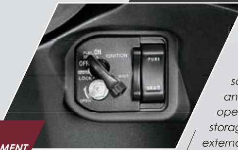
MULTI FUNCTION SWITCH UNIT

One compact console ensures safety of the vehicle and convenience of opening underseat storage & external fuel lid.