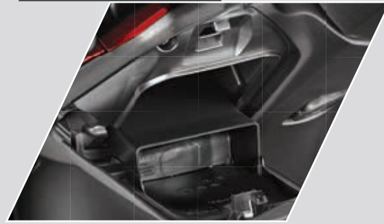
FRONT GLOVE BOX

Fuel filling right at your fingertips. Now get fuel filled while sitting on your scooter.