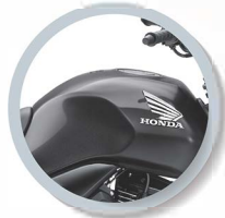
Mat Axis Gray Metallic