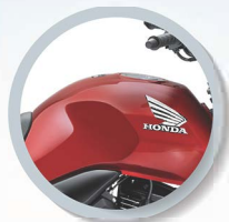
Imperial Red Metallic