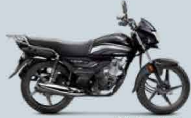
Black with Grey