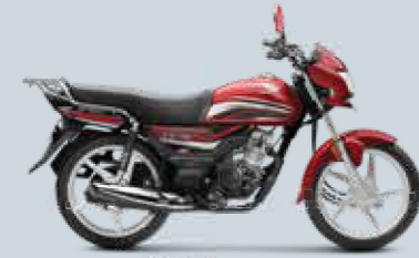
Imperial Red Metallic