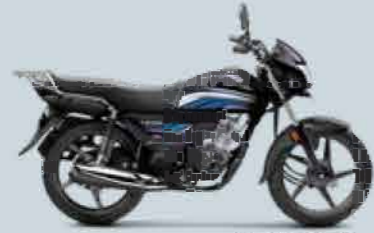
Black with Blue