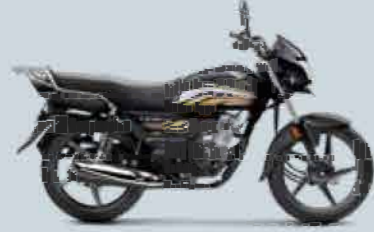
Black with Cabin Gold