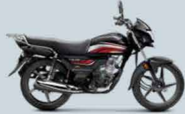
Black with Red