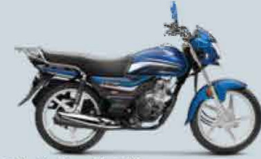
Athletic Blue Metallic